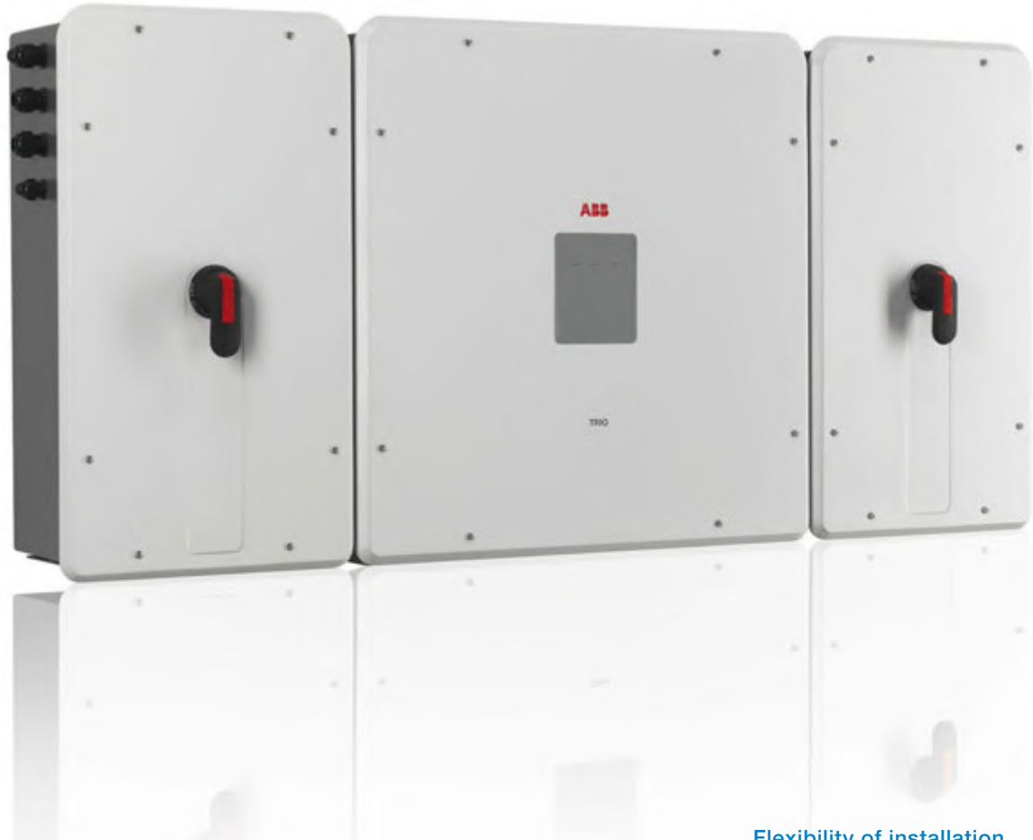
ABB string inverters TRIO-50.0-TL-OUTD 50 kW

The new TRIO-50.0 inverter is ABB's three-phase string solution for cost efficient large decentralized photovoltaic systems for both commercial and utility applications.